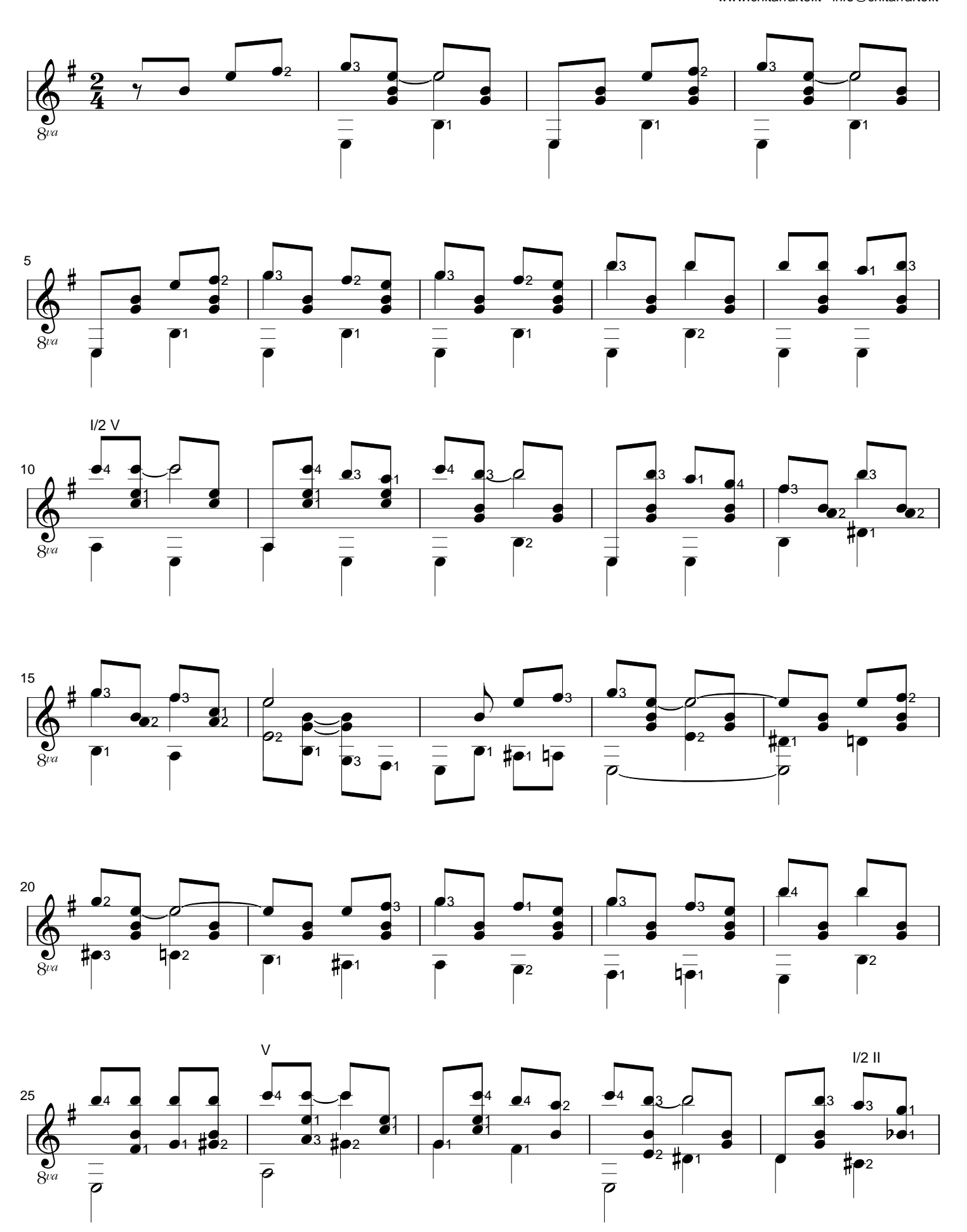
Page 1 / 2